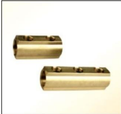
Brass Manifold FF