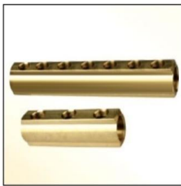
Brass Manifold FF