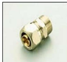
Male & Female Adaptor